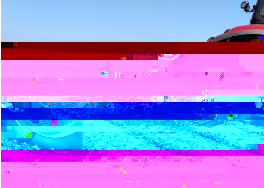
Second tine weeding on 7/19